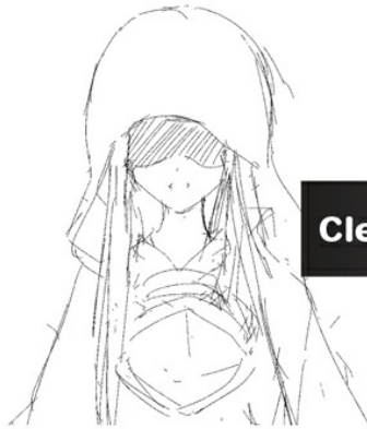
Clear Ice Ilhue