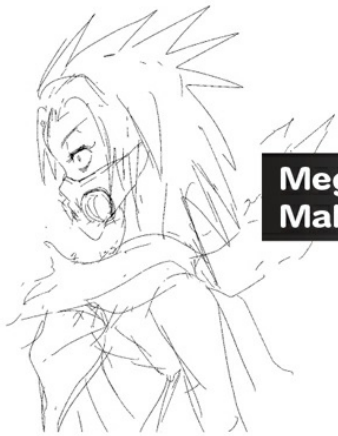
Mega the Malodorous