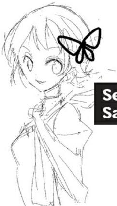
Selea the Savage Moth