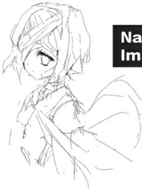
Naru the Imaginary