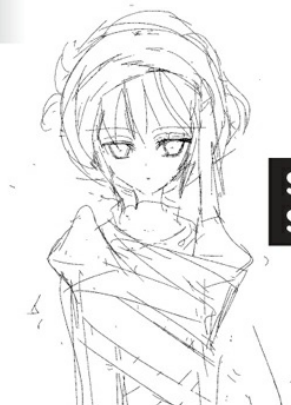
Sarelil the Shatterer