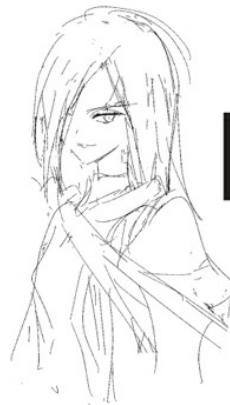
Phillea the Cruel