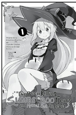
Manga Volumes 1-4

SLIME TAOSHITE SANBYAKUNEN, SHIRANAIUCHINI LEVEL MAX NI NATTEMASHITA © 2017 Kisetsu Morita © 2017 Benio / SB Creative Corp.