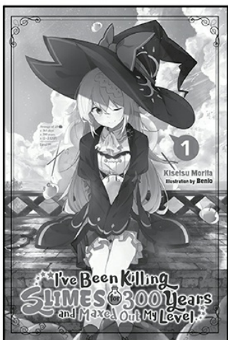
Light Novel Volumes 1-9