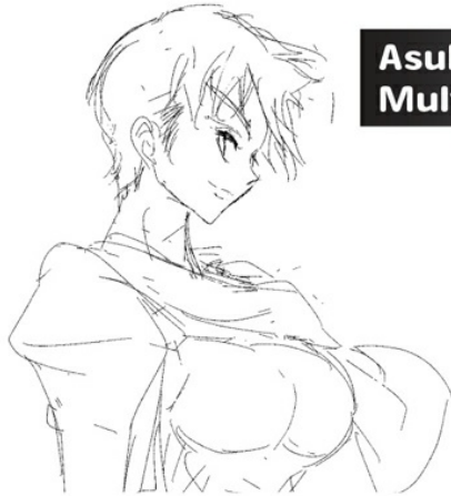
Asuka the Multitudinous