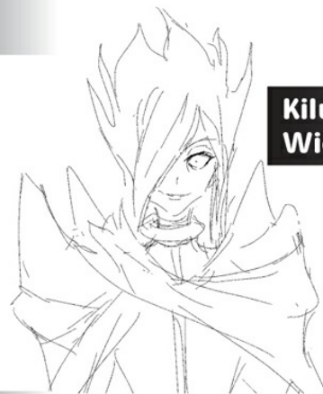
Kilue the Wicked